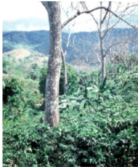
Natural regeneration of C. odorata in coffee plantation, Costa Rica.