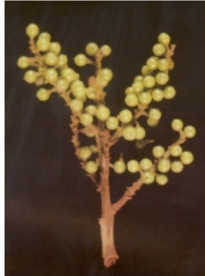
Immature fruits. From: Flores 1993.

Vegetative propagation with pseudocuttings is also possible.