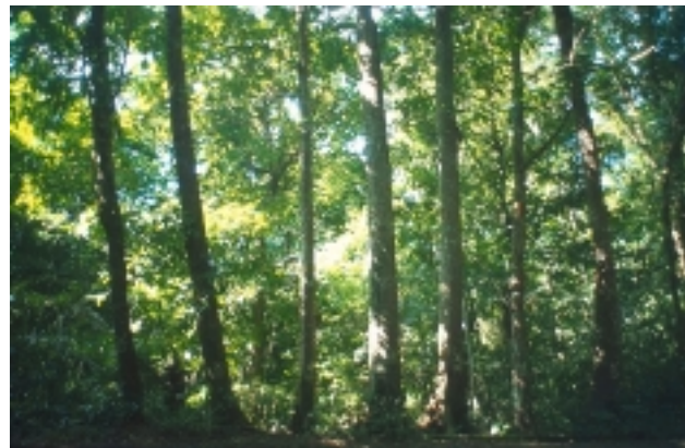
Stem variation in Swietenia macrophylla. Philippines.